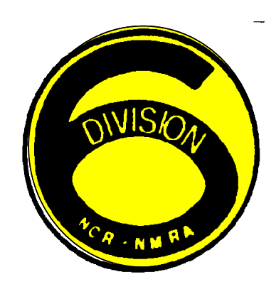
OFFICIAL NEWSLETTER OF DIVISION SIX OF THE NORTH CENTRAL REGION OF THE NATIONAL MODEL RAILROAD ASSOCIATION